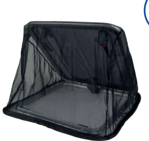
HATCHES - REGULAR Product size 620 x 620 mm (24" x 24")