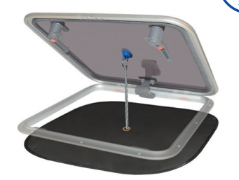
HATCHES - SMALL

Cut out size < 300 x 300 mm (12" x 12") Product size 350 x 350 mm (14" x 14")