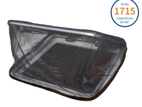
HATCHES - LARGE